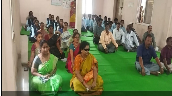
2WH7+VJ3, Avanigadda, Andhra Pradesh 521121, India, Lat: 16.029263, Long: 80.914349 21 Jun, 25, 06:55 am, Saturday