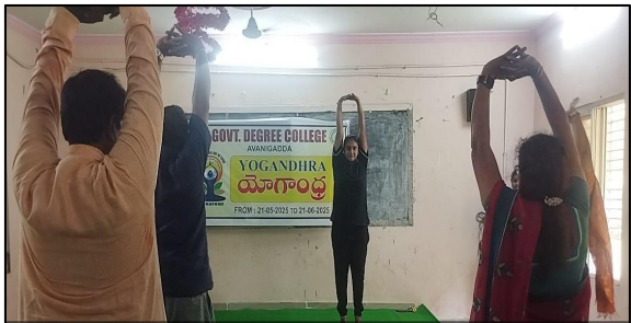
2WH7+VJ3, Avanigadda, Andhra Pradesh 521121, India, Lat: 16.029104, Long: 80.914466 21 Jun, 25, 07:06 am, Saturday