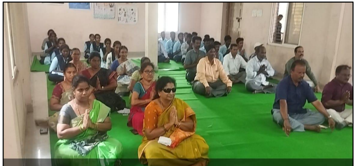
2WH7+VJ3, Avanigadda, Andhra Pradesh 521121, India, Lat: 16.029258, Long: 80.914358 21 Jun, 25, 06:56 am, Saturday