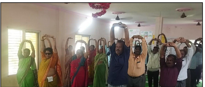
2WH7+VJ3, Avanigadda, Andhra Pradesh 521121, India, Lat: 16.029157, Long: 80.914408 21 Jun, 25, 07:07 am, Saturday