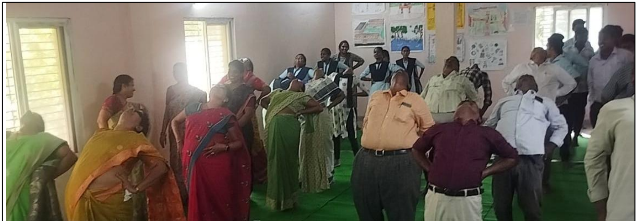
2WH7+VJ3, Avanigadda, Andhra Pradesh 521121, India, Lat: 16.029129, Long: 80.914396 21 Jun, 25, 07:07 am, Saturday