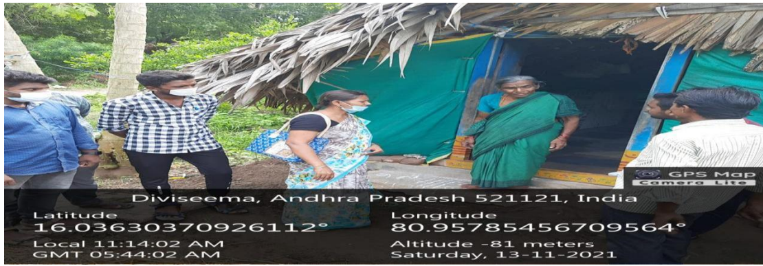
Survey on ecrop enrollment -13/11/2021