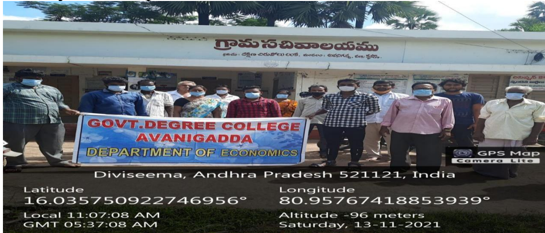
SURVEY ON ECROP ENROLLMENT 13/11/2021