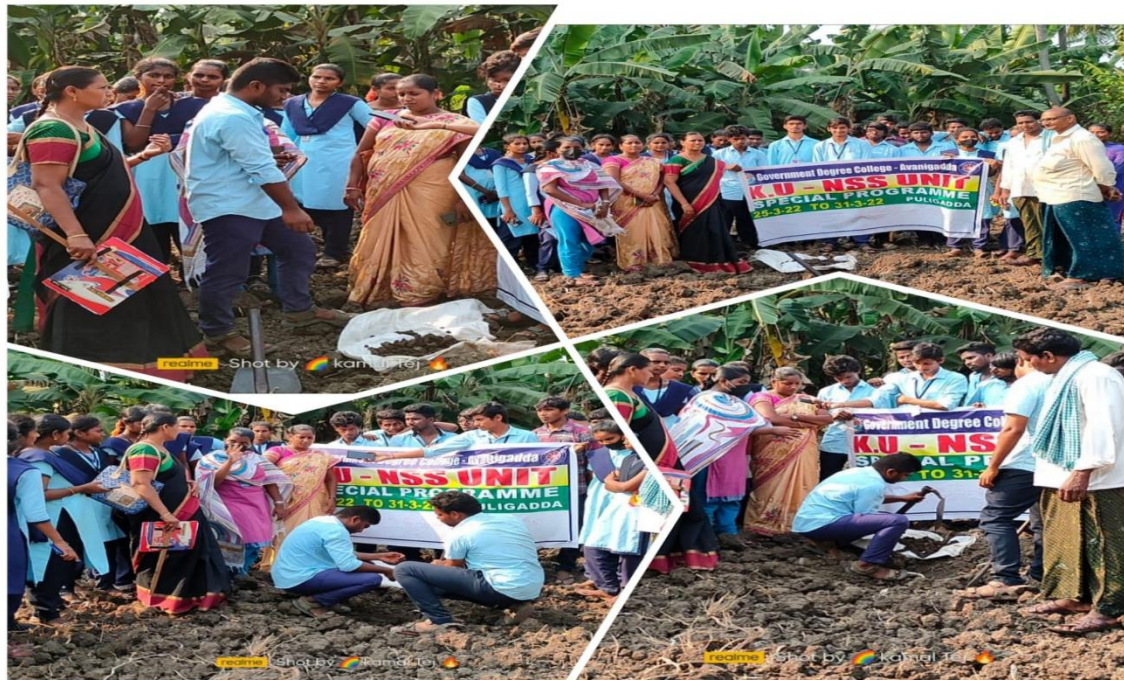
SOIL TESTS AT PULIGADDA on 29/03/2022