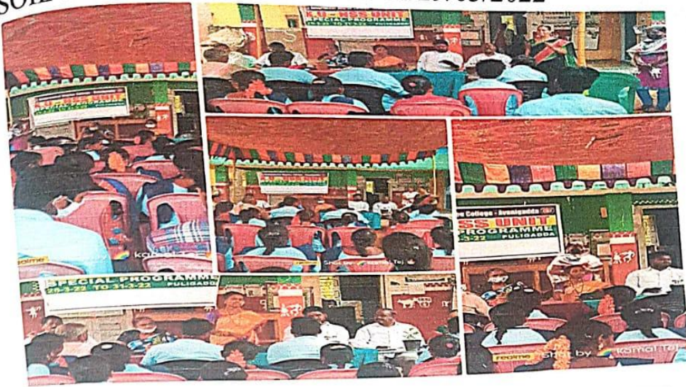
AWARENESS PROGRAMME ON ORGANIC FARMING AT PULIGADDA 29/03/2022